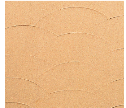
KRM Fan Finish

Faster Installation: Despite their identical appearance to traditional plaster, Eco De Vita™ KRM and KRT use a nontoxic organic binder in lieu of lime or gypsum. This reduces curing time. The products can be applied by spray machine, which significantly saves application labor. To ease ceiling application, KRT uses lightweight ingredients in lieu of natural aggregates. If desired, a variety of textured finishing can be added by hand trowel.